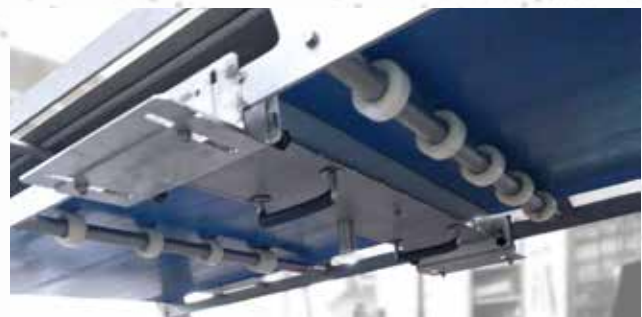
sa donje strane transportne trake - under the belt