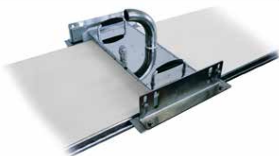
sa gornje strane transportne trake - on top of the belt

sa postojećim propisima HACCP i uticaju na životnu sredinu. Pokreće ga Menikini industrijski parogenerator koji isporučuje do 680 g/min pare, može se lako montirati sa bilo koje strane transportne trake i dostupan je u različitim veličinama. Suva para se dovodi direktno na pojas i momentalno rastvara prljavštinu i ostatke proizvodnog procesa. Dubinski čisti, jer prodire u mikropore površine. Integrisana usisna komora eliminiše prljavštinu, ostavljajući transportnu traku suvom, čistom i dezinfikovanom.